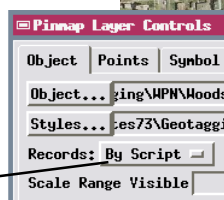
Full set of photo pins (no selection script).

Use the Query menu on the Script panel of the Pinmap Layer Controls to select an existing script, or enter a new script in the editing pane.