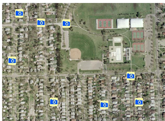
Pins selected by date and time.

The DATETIME class members and methods can be used in a script to select photos taken on a particular date or before or after a certain date and time. The photos in the sample table were taken from 14 November 2004 through 7 July 2005. The sample script selects photos taken after 12 noon on 1 June 2005.